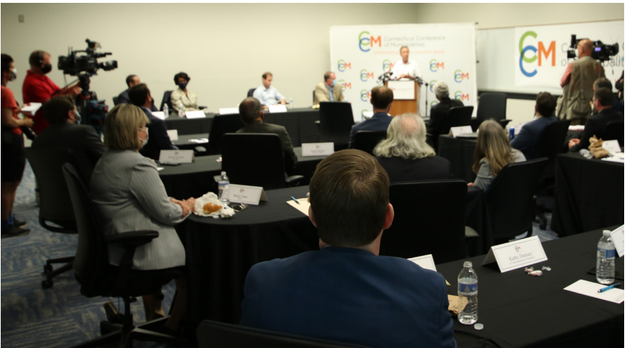
Governor Lamont spoke at the ARP Advisory committee's recent meeting held at CCM's offices in New Haven

This toolkit is intended to be a resource and supplement formal information provided by federal and state government agencies. CCM encourages local officials to continue to refer to the Interim Rule issued by the Department of Treasury for formal guidance.